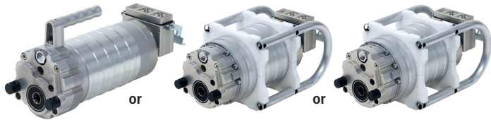
15 kW HF-motor