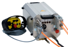
Pentpak 427 HF-power pack with cables and remote control