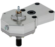
ST2 or ST3 Spindle unit for MG41 with 1-1/4" drill spindle