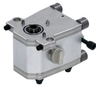
MG41 4-step gearbox