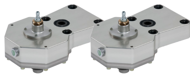
ST2 or ST3 Spindle unit for MG41 with QDC Quick Disconnect Coupling for drill bit