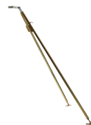
RST-CN-U Rear support for male coupling